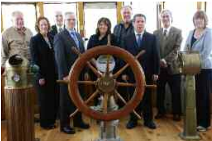
SWOTC's new Board of Directors at their inaugural meeting held in Norfolk County

Southwest Ontario Tourism Corporation (Region #1), known as SWOTC, was formed as a result of a provincial restructuring in Ontario's tourism industry. Representatives from Norfolk County, Chatham-Kent, Elgin County, Haldimand County, London, Middlesex County, Oxford County, Sarnia-Lambton and Windsor-Essex-Pelee work together to build and support competitive and sustainable tourism in their region. The Regional Tourism Organization has recently completed seven priority projects, including a market development strategy, agri-tourism strategy, birding assessment and strategy, culinary guide project, motorcycle tourism project, port coastal riverfront communities development plan and investment strategy and a recreation experience assessment. In particular, SWOTC has launched an online toolkit to assist agri-tourism operators and developed a strategy to lure investment to the region's key ports and waterfronts.